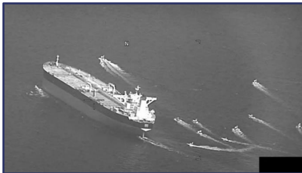
Figure 1: The TMO Niovi being swarmed by a dozen small boats from the IRGCN, moments before she was seized and sent to Bandar Abbas, Iran.

The countries participating in the European Maritime Awareness mission in the Strait of Hormuz (EMASoH), Belgium, Denmark, France, Germany, Greece, Italy, The Netherlands, Norway and Portugal, condemn the seizure of the merchant vessel Advantage Sweet by the Iranian Navy on the 27 th of April 2023 and the seizure of the merchant vessel Niovi by the Islamic Revolutionary Guards Corps Navy (IRGCN) on the 3 rd of May 2023 in breach of international law.